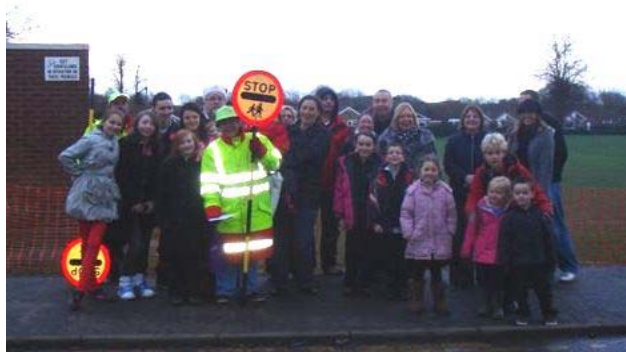
Michael Drayton Junior and Hartshill Secondary Schools.

We wish her a long and happy retirement.